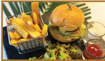
Burasari Beef Burger