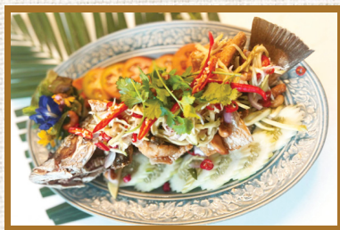
Pla Krapong Tod Nam Pla