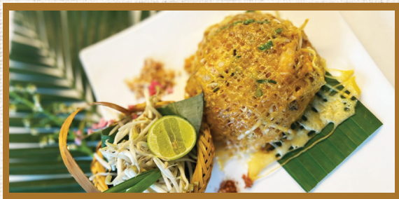
Pad Thai Goong Sod