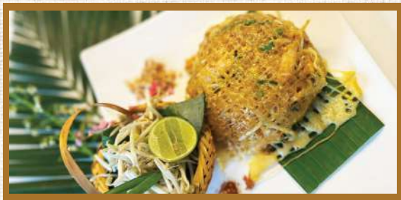
Pad Thai Goong Sod