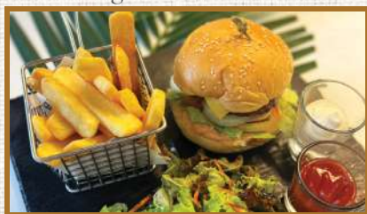
Burasari Beef Burger