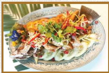
Pla Krapong Tod Nam Pla

Pad Krapao Talay / ผัดกระเพราทะเล 320 baht Stir-fried seafood with Holy basil leaf, chili and garlic "Pad Krapao" is one of the most popular Thai street food dishes